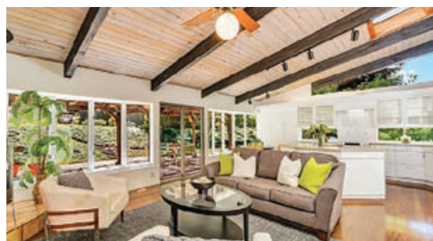
58 EVERGREEN DRIVE | ORINDA $1,375,000 4 BR | 2 BA | 2270 Sq. Ft. Diane Petek | CalBRE#01703677