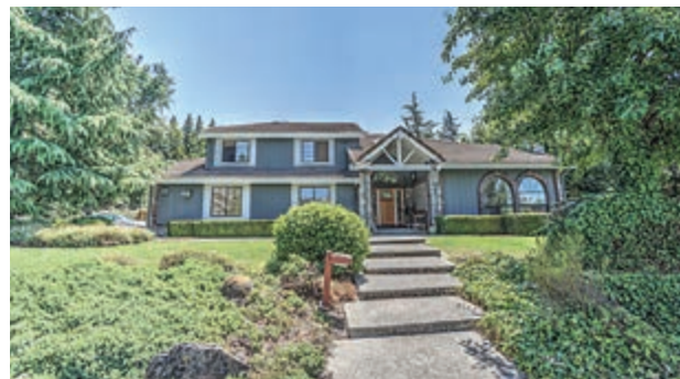
4 LAMP COURT | MORAGA $1,795,000 5 BR | 2.5 BA | 3092 Sq. Ft. Elena Hood | CalBRE#01221247