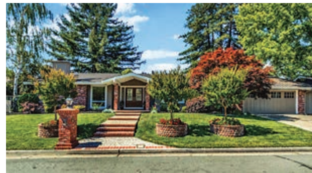
473 THARP DRIVE | MORAGA $1,425,000 4 BR | 3 BA | 2759 Sq. Ft. Lynn Molloy | CalBRE#01910108