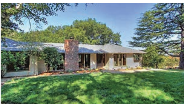
10 VISTA DEL ORINDA | ORINDA $1,350,000 4 BR | 2 BA | 2596 Sq. Ft. Laura Abrams | CalBRE#01272382