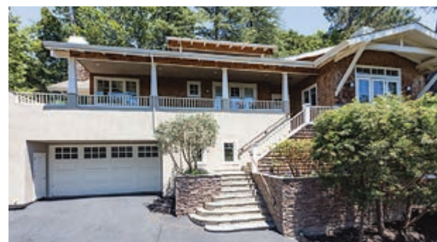
7 LA CINTILLA | ORINDA $2,795,000 4 BR | 4 BA | 4106 Sq. Ft. Melanie Snow | CalBRE#00878893