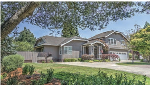
10 BRANDT DRIVE | MORAGA $1,750,000 5 BR | 3.5 BA | 3692 Sq. Ft. Elena Hood | CalBRE#01221247