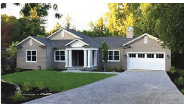
55 DONNA MARIA WAY | ORINDA $2,950,000 5 BR | 4.5 BA | 3907 Sq. Ft. The Beaubelle Group | CalBRE#00678426